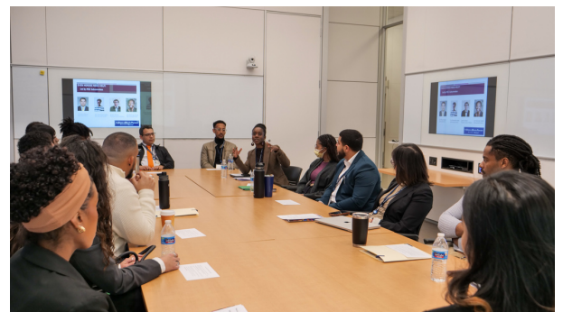
Programming for second-year medical students