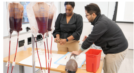
Programming for fourth-year medical students