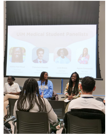
Programming for first-year Medical Students