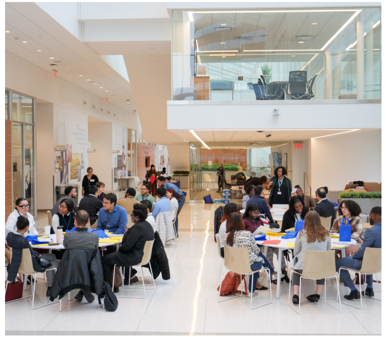
Icebreaker and lunch between Pathways to Excellence in Medicine Mentorship Cohort and their mentors: IBC Housestaff Scholars and IBC Faculty Mentors