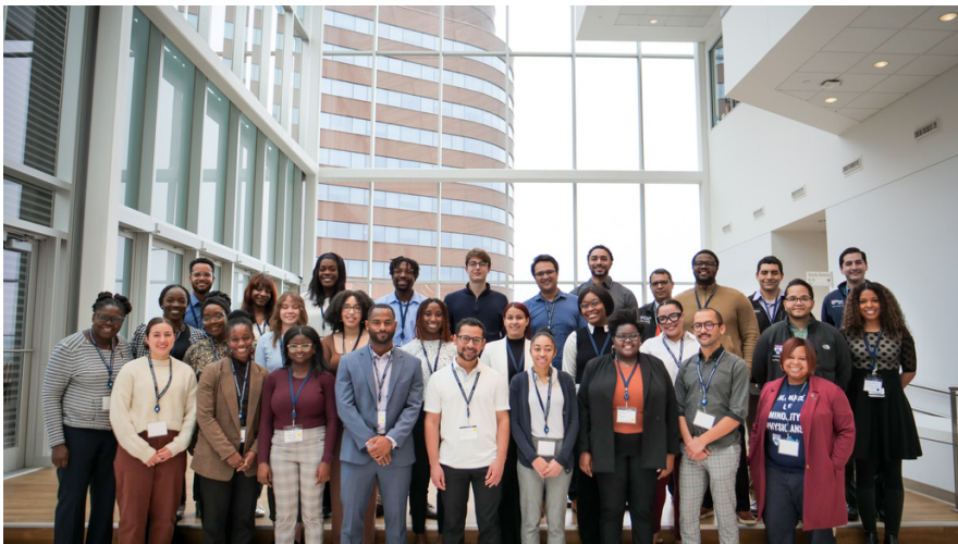
Pathways to Excellence in Medicine Mentorship Cohort, IBC Housestaff Scholars, and IBC Faculty Mentors

Exclusive programming for our Mentorship Cohort, comprised of 19 first-year URiM medical students from across Philadelphia