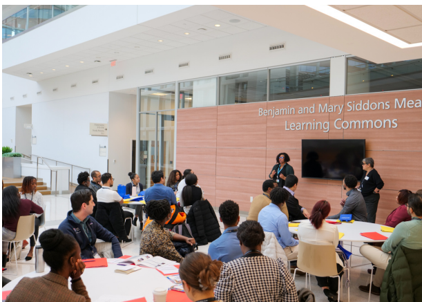
Welcome Remarks to the Mentorship Cohort Programming