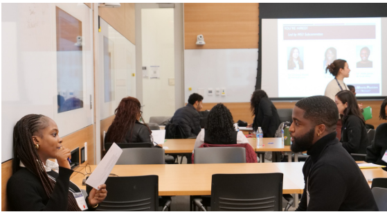
Programming for third-year medical students