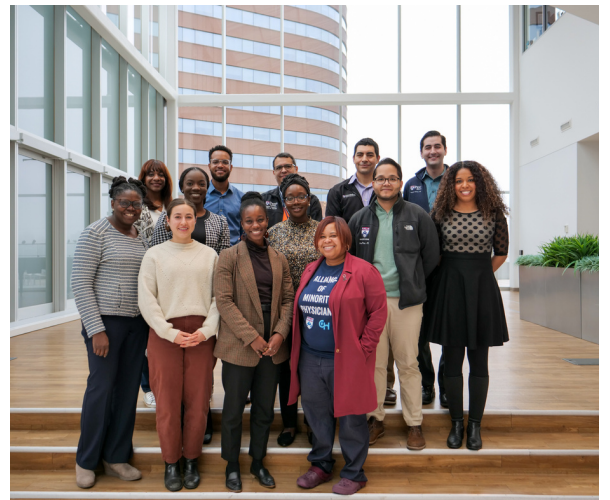
IBC Housestaff Scholars and IBC Faculty Mentors