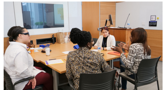
Programming for mentees and mentors including whole group discussions and small group activities