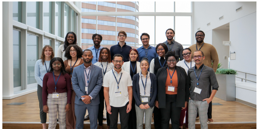
Pathways to Excellence in Medicine Mentorship Cohort